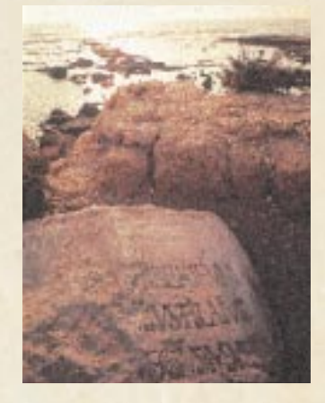
Critics who usere dubious about the historicity of Pontius Pilate usere silenced by the twentieth-century discovery of a partially effaced stone inscription in sesside Caesarea." ...NTUS PILATUS ...ECTUS UDAE ... "it reads, identifying bina as prefect of Judea. After the original was removed to a museum, this replica was placed at the discovery site near the ancient amphitheater of the city.

For reasons that are unclear, Pilate was suspended from office in A.D. 37. Tradition holds that he committed suicide in 39. According to some early Christian writers, he killed himself in remorse over his part in the Crucifixion. Others say he recognized Jesus' divinity and became a believer himself. Over the centuries, that line of thought brought Pilate quite an honor: In the Ethiopic and Coptic churches, he is venerated as a saint.