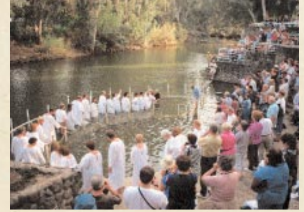
About ten miles downstream from Lake Tiberias is the second site on the Jordan claimed as the place where John baptized Jesus. Special facilities have been provided for the droves of visitors such as these American pilgrims (top and above), clad in white robes, who have lined up for baptism, often rebaptism, in the hallowed waters of the River Jordan.