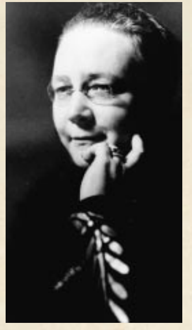
For British author and playwright Dorothy Sayers, Jesus died at the hands of people with no more malice than others in history, whose motives were defensible and even sometimes praiseworthy.

"Show people that and they are shocked. So they should be. If that does not shock them, nothing can."